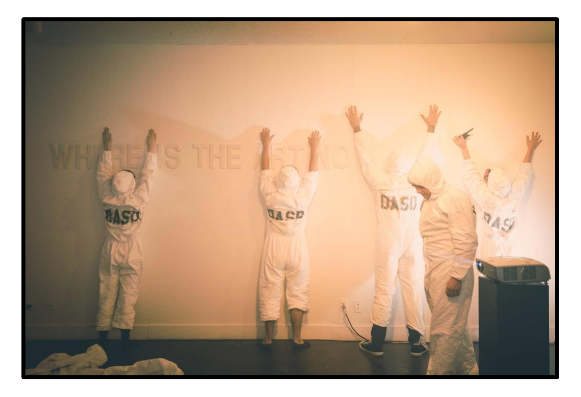
Figure 2: Audience members line up against the wall of "Where is the Art Now?" during a "Code Garland"

The culmination of TWSAS echoed Dada and Absurdism; patrons assumed a remarkable, dangerous work of art awaited them in the interior room (not visible to the audience on the sidewalk). This assumption turned out to be false as the performers led each participant to a back door that opened on a vacant alley. Deposited back into the world with no cathartic event, the audience stood in the alley, asking each other, "Was that it?" The tension built through the restrictive behavior evaporated, and all the absurd demands appeared to be for naught. Through Absurdist means, TWSAS deconstructed the seemingly arbitrary nature of "safety" regulation in an arts space and critiqued the ways code designations and requirements limit artists' abilities to create freely. By connecting "safety" regulations with subversive behavior, Terry took the city's perception of art as a dangerous entity in its own right to task.